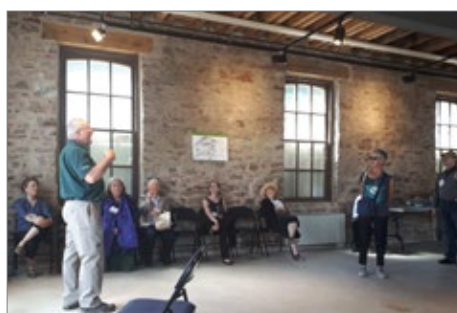
Canal tour talk