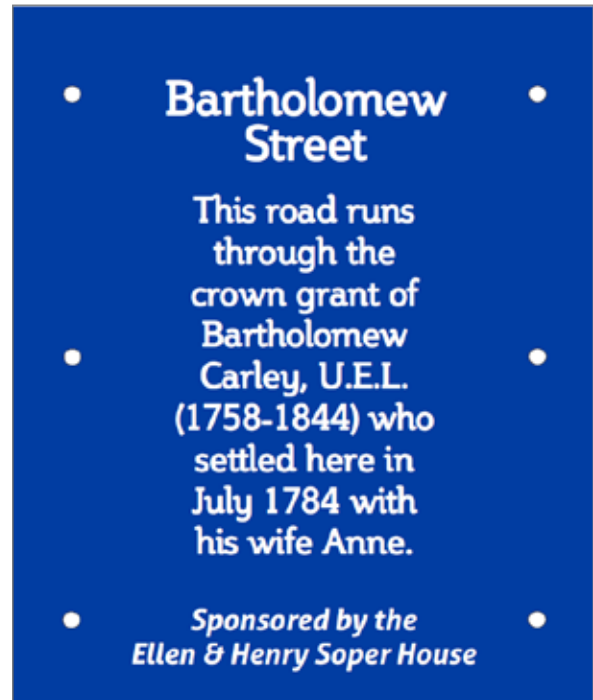
Bartholomew St. plaque

different streets. While streets in the historic downtown are being done first because of high tourist exposure, we expect this initiative to expand throughout the city. Ten streets were done initially and feedback from the community was 100% positive. The signs are unobtrusive and catch the attention of those passing by as an interesting looking curiosity. Each engraved sign costs about thirty dollars and is fully funded/ sponsored by individuals or local businesses.