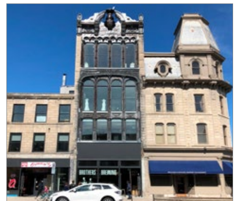
Petrie Building in Doors Open Guelph

Community events like Doors Open Ontario encourage pride of place and demonstrate the benefits