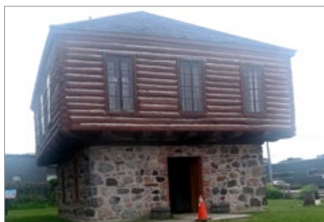
Clergue house