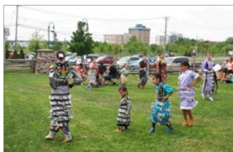
Indigenous dancers picnic lunch