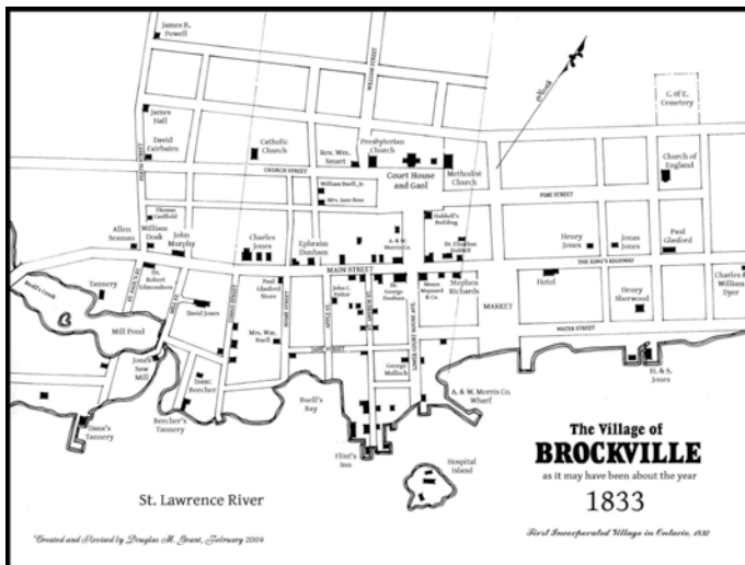
Map of Brockville c. 1833

Street names are often suggested by developers to tie into their Plan of Subdivision while some may have been selected by Council as a form of recognition of a person, place or event. Others have always "just been called that". Well, not always! Many of these old streets date back to the original settlement. Even before Brockville was incorporated in 1832, it was a thriving community with a well established and surveyed official street layout. The names of those first streets are part of our history and each has its own story. Some are self explanatory, like Church St. or Water St., but many are based on individuals who have played an important role in our past or are reminders of what was there before, such as Orchard Street.