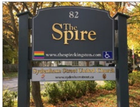
The Spire in Kingston

For the heritage portions of the building, the exterior and some features of the interior are designated under the Ontario Heritage Act. The Spire is also an anchor building in the Old Sydenham Heritage District in Kingston.