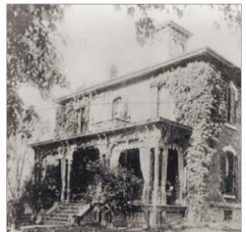
Front porch c. 1891