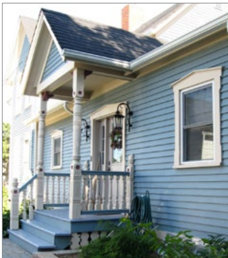
Back addition and side entrance c. 2005

An addition built at the back of the house in 2005 blends well, keeping with the design features reminiscent of the Italian Villa style and reflecting the same ornate detail as the front entrance. In constructing the addition, they reused posts that a neighbour was discarding, for the side porch.