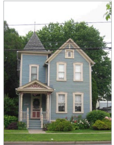
434 Sydney St., Cornwall

Italian Villas have prominent, highly decorated entrances or campaniles and this house is a good example, with its most striking feature, a simple finial. It has a highly decorated pedimented portico; the pediment's cornice is supported by decorative modillions and the tympanum contains a decorative pattern.