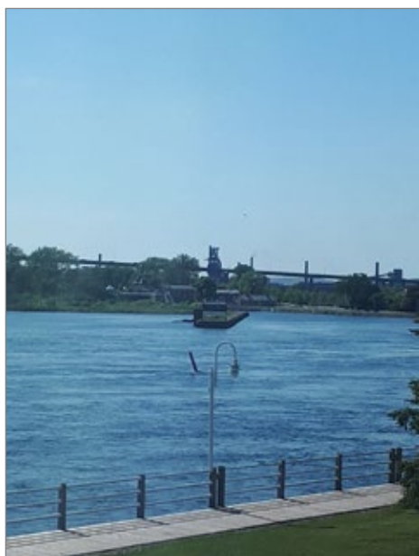
Canal lock