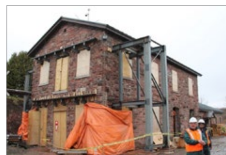
Canal Stores Building