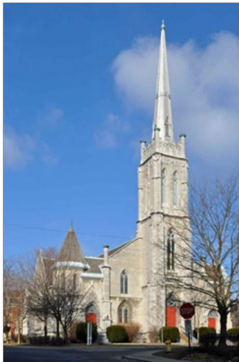
The Spire in Kingston

For more than 160 years the magnificent historic church at 82 Sydenham St., with its recognizable spire, has been a notable Kingston landmark. Now known as The Spire , it is evolving to become a community hub supporting a wide constituency of groups – beyond its traditional role as a place of worship.