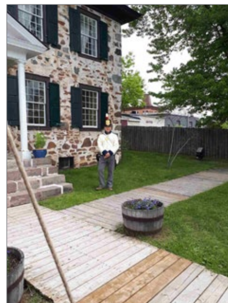
Ermatinger Old Stone House