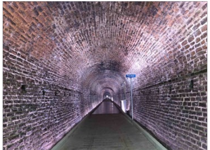
Brockville Railway Tunnel Committee was recognized for the restoration and reopening of the Brockville Railway Tunnel

Last year's awards were given to Casey House restoration in Toronto, where both the interior and exterior of the building are designated under the Ontario Heritage Act, for its redevelopment as a new AIDS/HIV healthcare facility that integrates the historic building with a four-storey extension. The Township of North Glengarry's Arts, Culture and Heritage Committee received an award for the Glengarry Routes Heritage Tour and Community Improvement Plan. Finally, the Brockville Railway Tunnel Committee was recognized for the restoration and reopening of the Brockville Railway Tunnel. The project rehabilitated the structure and created a destination, highlighting its uniqueness, while utilizing it as a teaching and research resource. I was able to step inside the railway tunnel this past spring and it was truly an unforgettable experience.