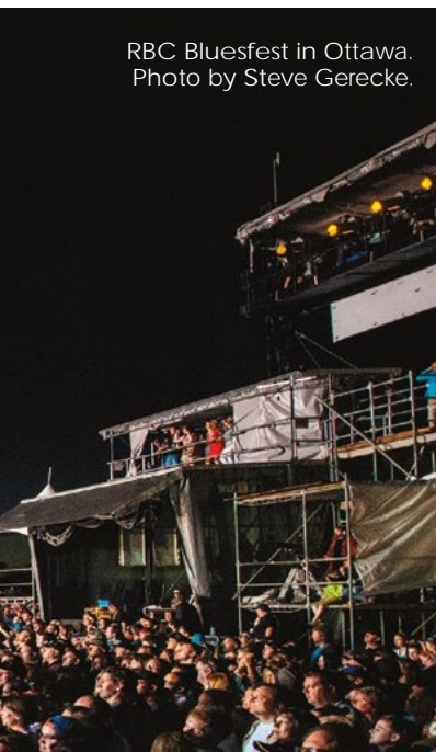
RBC Bluesfest in Ottawa.