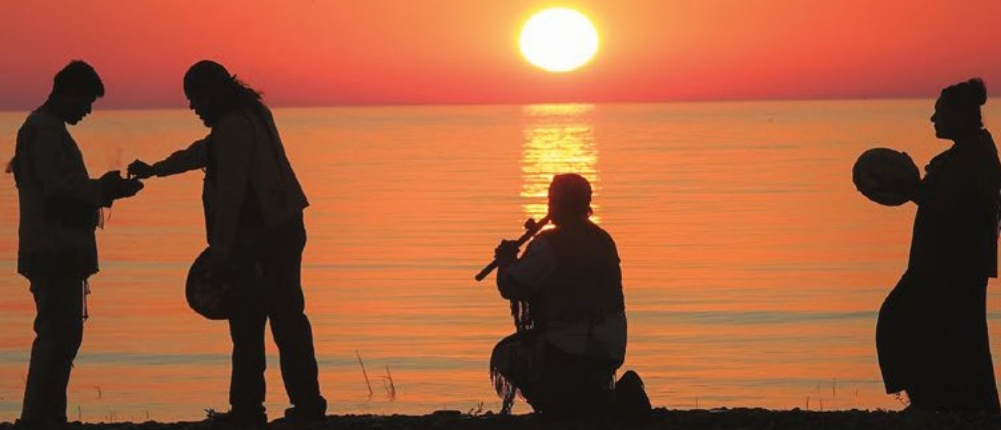
The Global Savages Sunrise Ceremony on Wikwemikong Bay.