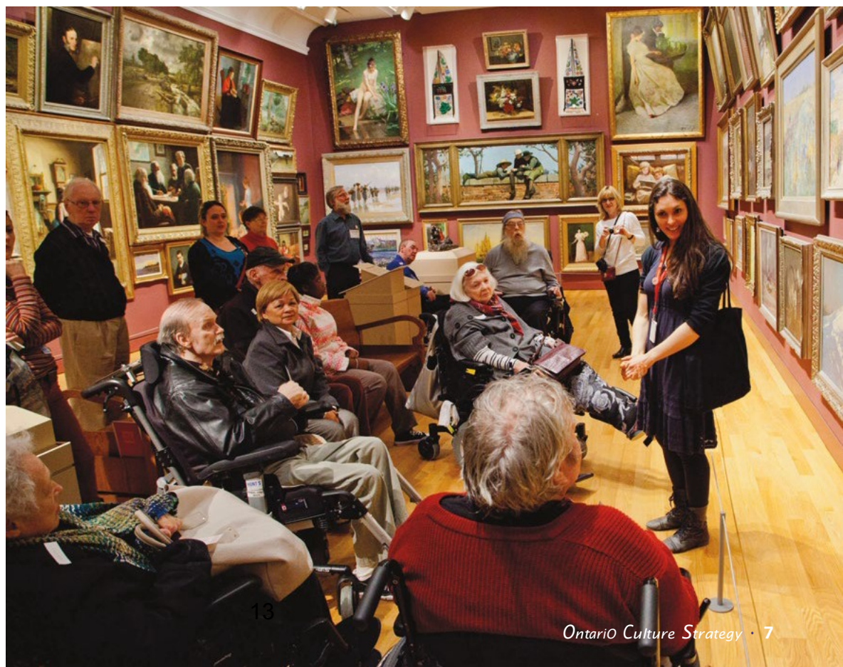
Art in the Moment gallery tour at the AGO.

As our public engagement process made clear, culture is a fundamental, organic and vital part of our lives and our community life. Many people spoke or wrote about culture as a fourth pillar of community sustainability and well-being, alongside social equity, economic health and environmental responsibility. 4 Participation in arts, culture and recreation is an indicator of quality of life in the Canadian Index of Wellbeing. 5