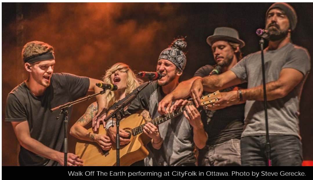
Walk Off The Earth performing at CityFolk in Ottawa.

Ontario continues to work with the Chiefs of Ontario to address issues around Indigenous heritage and burial sites in response to the report of the 2007 Ipperwash Inquiry. 14 We also built on two other critical relationship agreements in developing the Culture Strategy. In August 2015, the Chiefs of Ontario and the Government of Ontario signed an historic Political Accord to guide the relationship between First Nations and the province. The Accord affirms that First Nations have an inherent right to self-government, that the relationship between Ontario and First Nations must be based upon respect for this right and commits the parties to work together on issues of mutual interest. 15