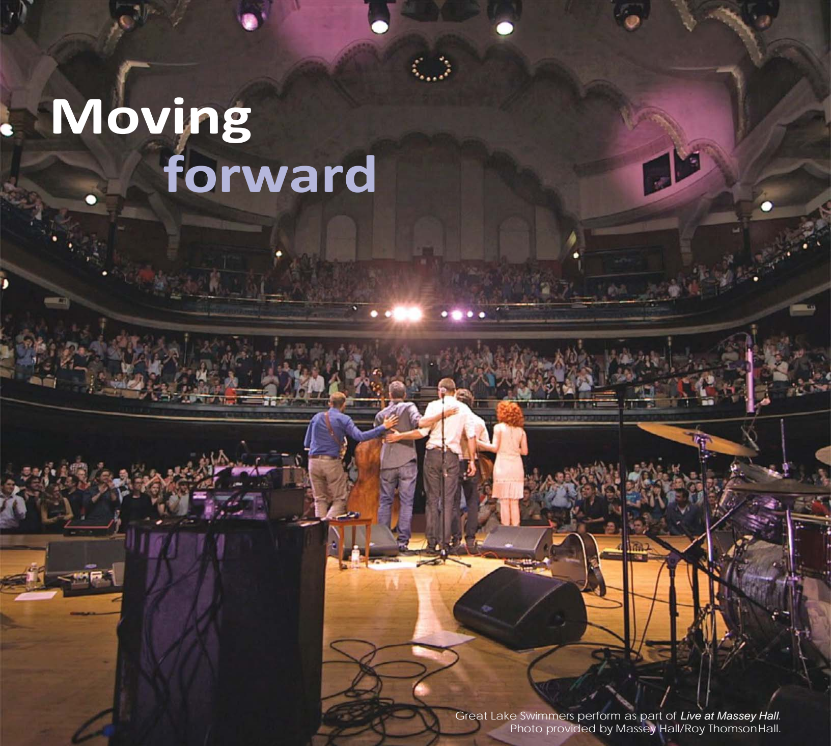
Great Lake Swimmers perform as part of Live at Massey Hall .