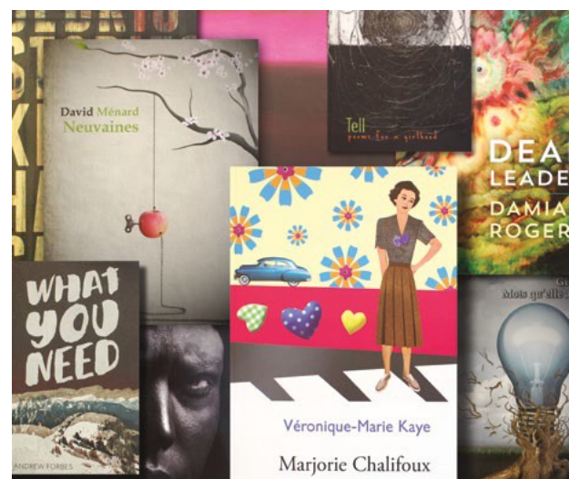
Selection of books shortlisted for the 2016 Trillium Book Award/ Prix littéraire Trillium.