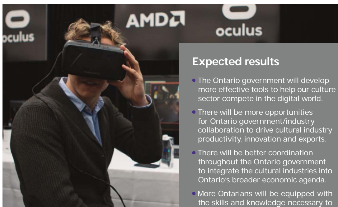
Virtual reality headset.