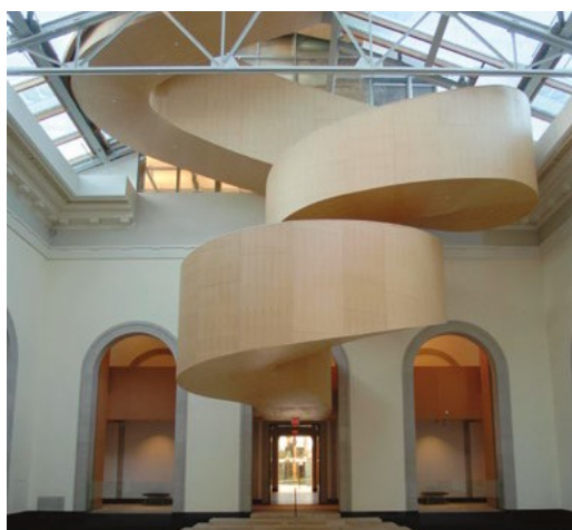
Frank Gehry's sculptural staircase at the AGO.

The Arts Policy Framework will help increase awareness within government of the size, scope and diversity of Ontario's arts sector and of the many opportunities available to integrate the arts into a range of policy and program areas. In turn, this will create new opportunities for artists and arts organizations to engage with other sectors. The Framework will also encourage and support government ministries and agencies to consider the needs and potential contributions of artists and arts organizations when they develop or review policies and programs.