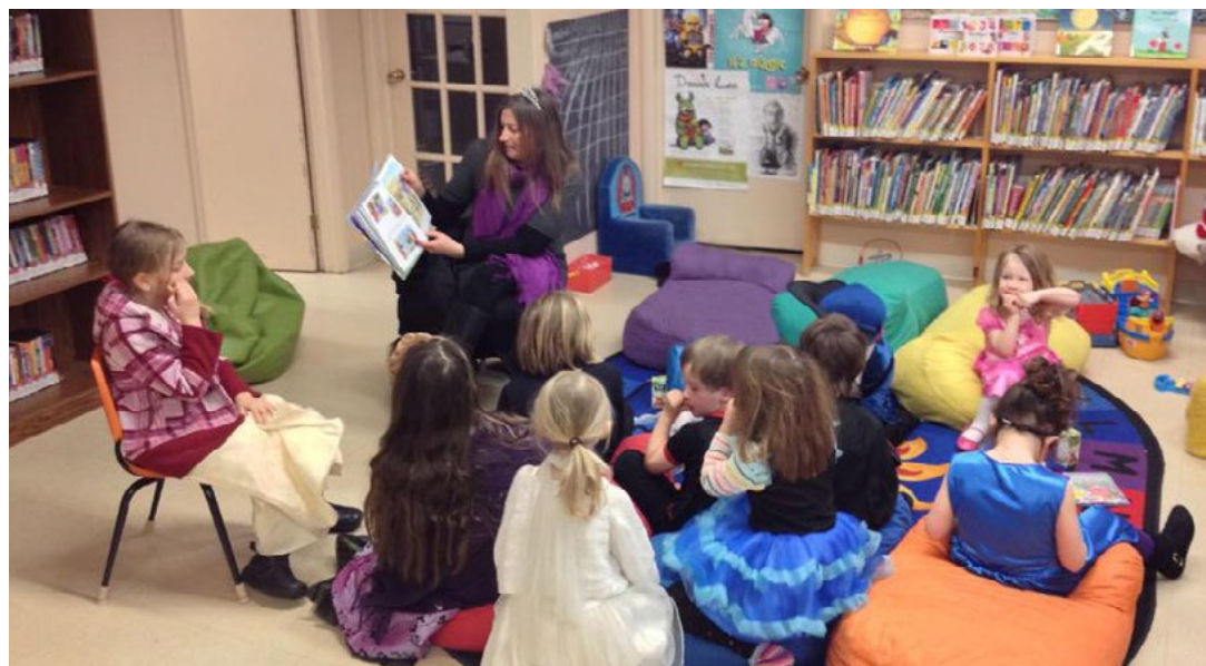
Children learning about the Jewish holiday, Purim.

We learned a great deal through Culture Talks. As we implement Ontario's Culture Strategy, continuing the dialogue will assist us in achieving the goals Ontarians helped us set. We will engage a great many individuals, partners, organizations and communities in that dialogue. By encouraging and facilitating broader collaboration and partnerships, the Culture Strategy will be a catalyst for renewed creative and economic energy in the culture sector and in communities across Ontario.