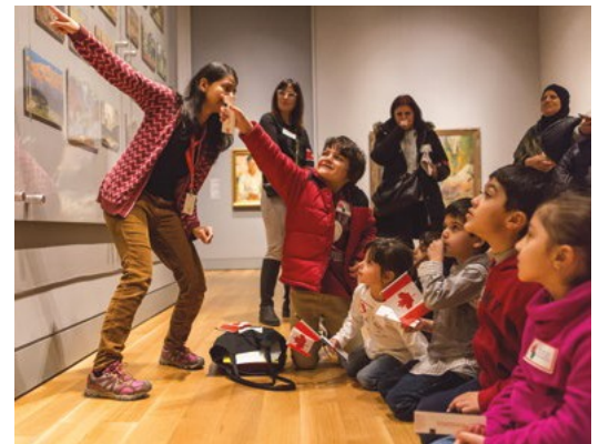
Visit to the AGO through the Institute for Canadian Citizenship's 'Ahlán Canada' program.

While we were developing the Strategy, the Truth and Reconciliation Commission of Canada released its final report, which shed light on the brutalities committed at residential schools and set out a path toward reconciliation for all Canadians. 12 The report exposes the terrible truth that the residential school system was specifically intended to destroy Indigenous identities and cultures. In our discussions with Indigenous partners and communities, we learned that reconnecting children and youth with their traditional cultures and languages is an urgent priority. The Journey Together: