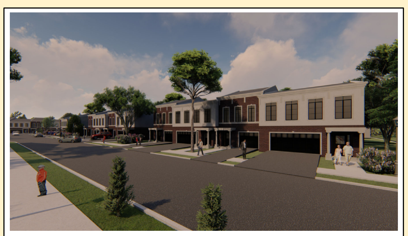
View: Western townhouse units facing west