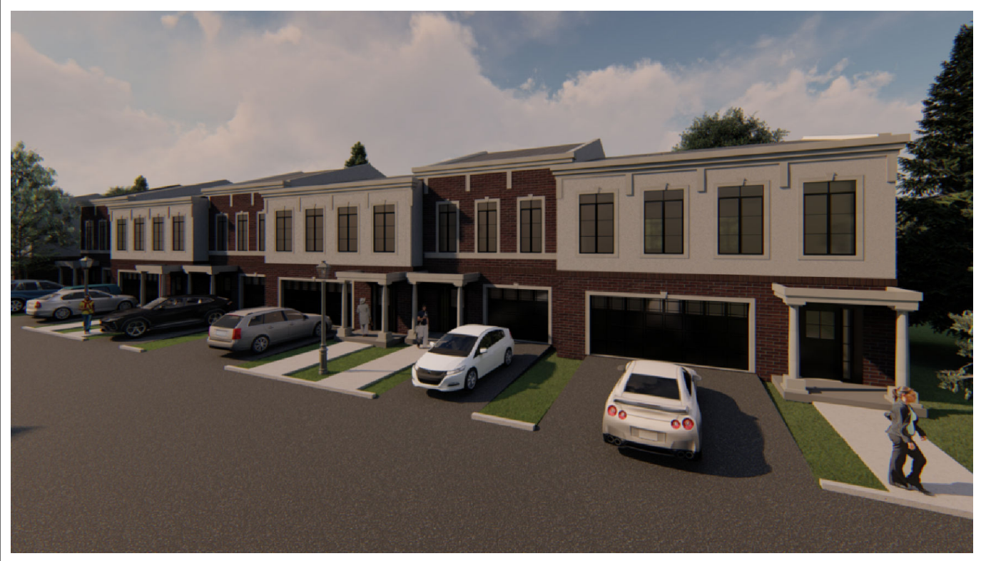
View: Southern townhouse units facing south