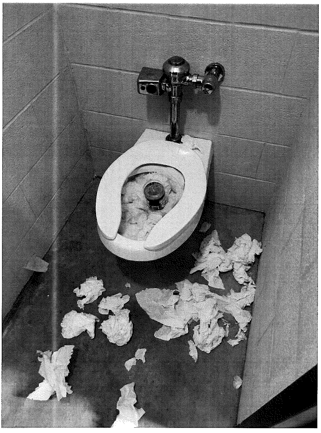
Page 3 of 5