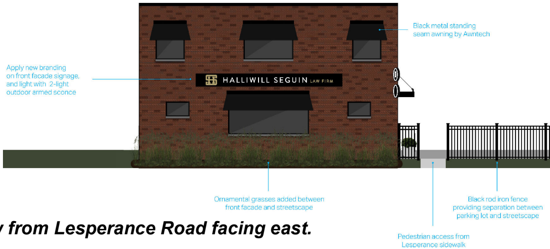
View from Lesperance Road facing east.