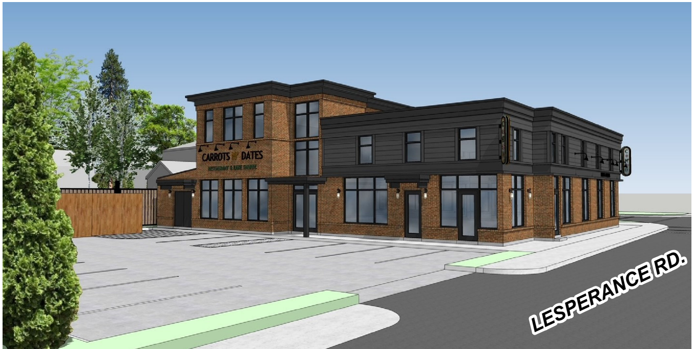
View from Lesperance Road facing southeast towards Tecumseh Road