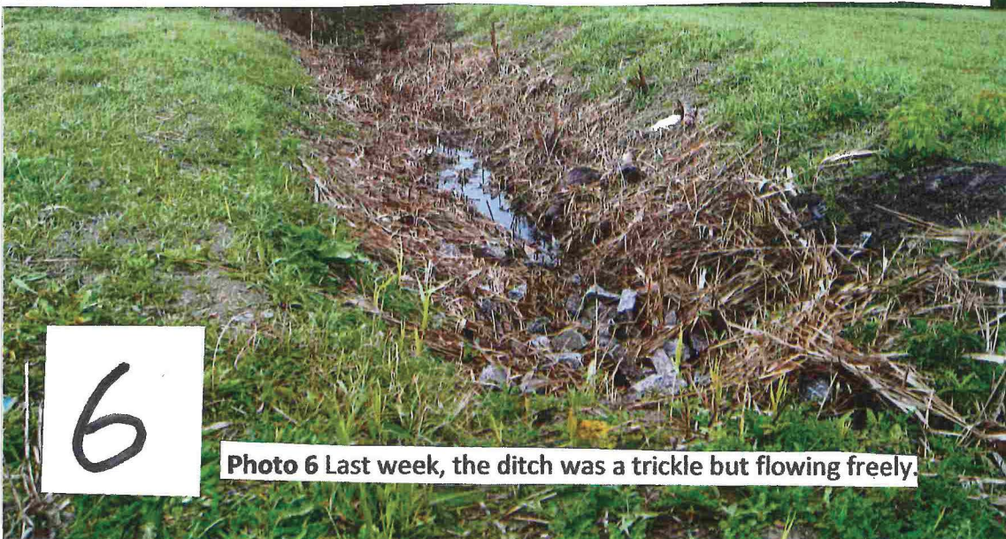
Photo 6 Last week, the ditch was a trickle but flowing freely.

The water wasn't flowing through the culvert under plaza and out to Hwy 22