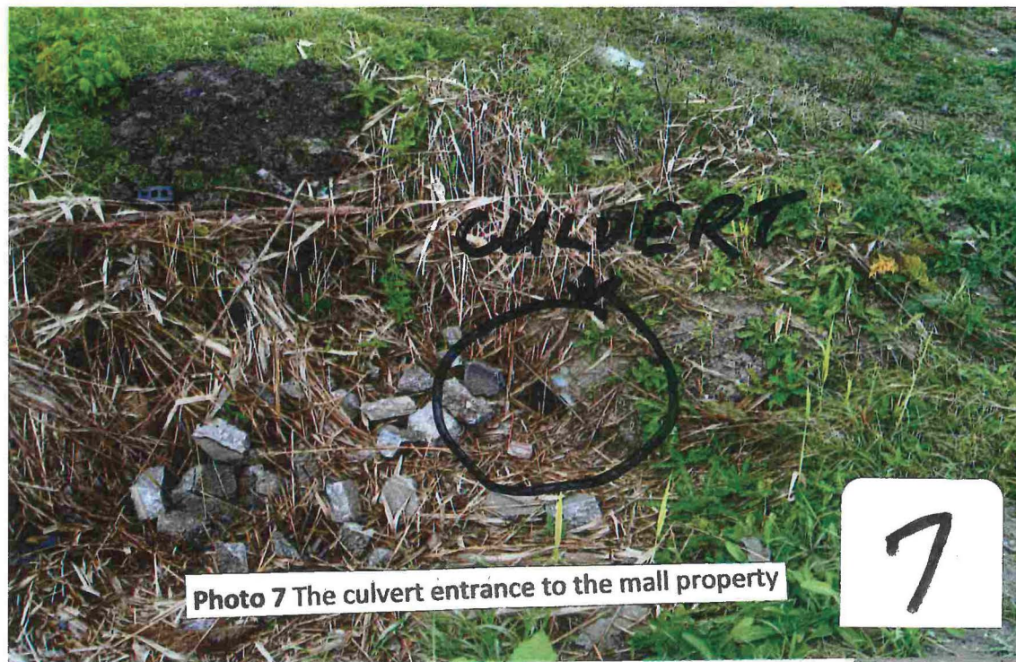
Photo 7 The culvert entrance to the mall property