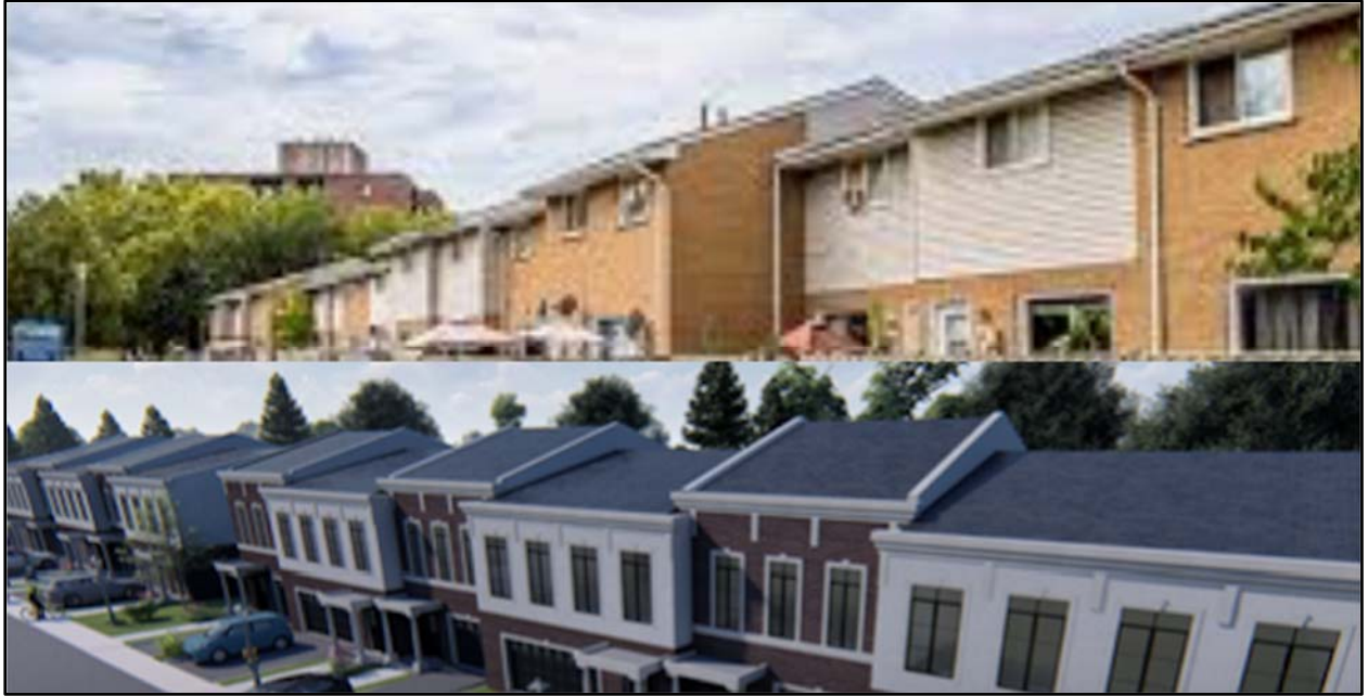
Figure 1: Roofline Comparison of proposed townhouses and nearby development

In response to this comparison the roofline has been revised to be a more traditional hip roof style with gables along the roof line to break-up large expanses. This roofline to more reflective of the style found on adjacent single detached dwellings. This roofline revision is only to the 2-storey townhouses along the westerly, and southerly property lines.