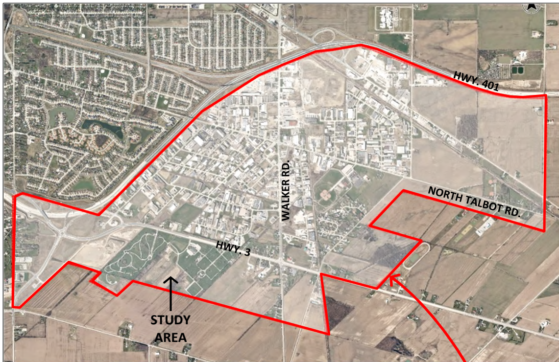
Oldcastle Business Park, Tecumseh