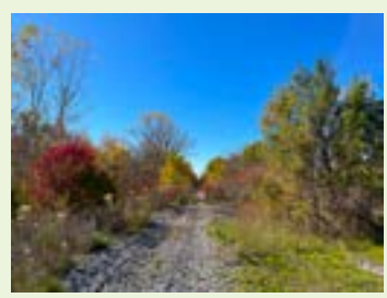
Photo: The CASO rail line (shown in red) will be transformed into a multi-use trail

The Municipality of Lakeshore, Town of Essex and Town of Tecumseh partnered with ERCA, which leveraged significant grant funds in addition to Clean Water~Green Spaces funding, to acquire the CASO rail line, which will be transformed into a 46 km multi-use trail for the benefit of the entire region.