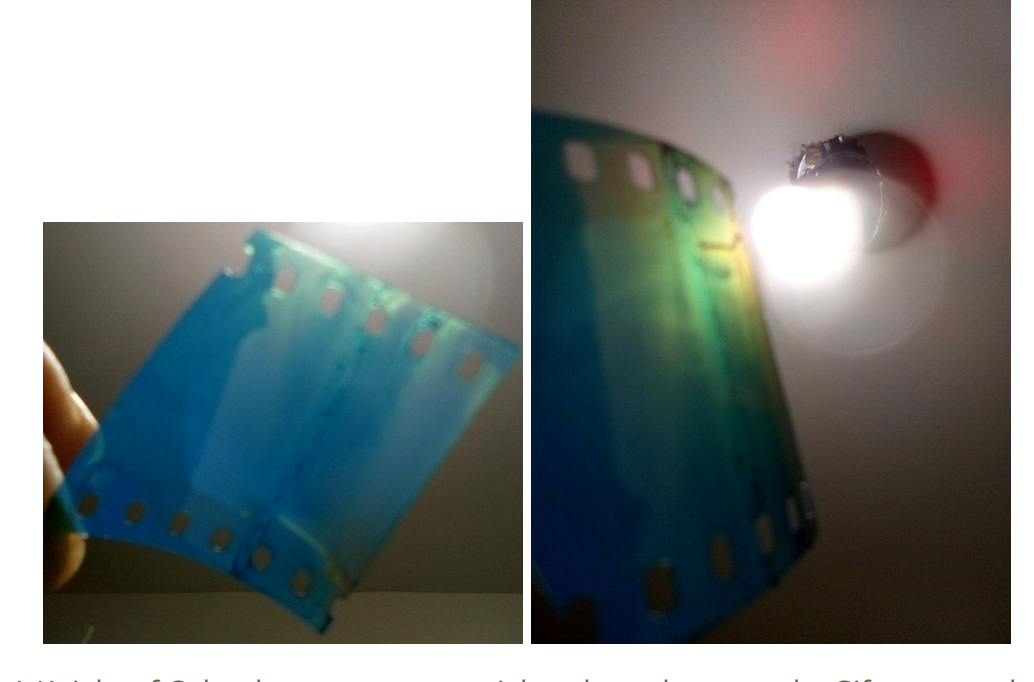
Fig's. A Knight of Columbus, transporter right edge column; and a Gift present, lensless holofilm under a lightbulb indoors,. The Knights' of Columbus showing me how to make the natural interactivity neuralink ornament sample: