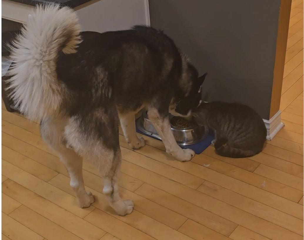
Sharing his food and water with our cat