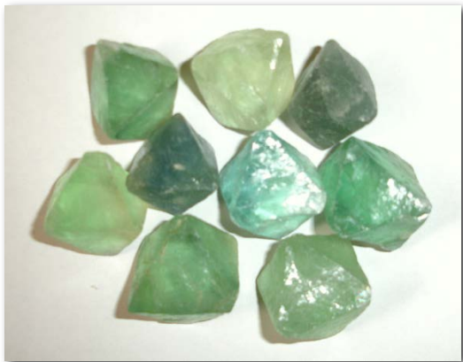
Calcium Fluoride \text{CaF}_2