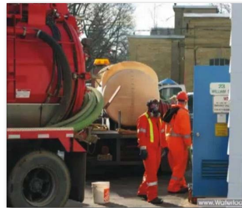
Hydrofluorosilicic Acid \text{H}_2\text{SiF}_6

Source: REAGENTS, INC.--MSDS--CALCIUM FLUORIDE