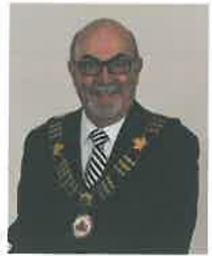
Mayor Gary McNamara