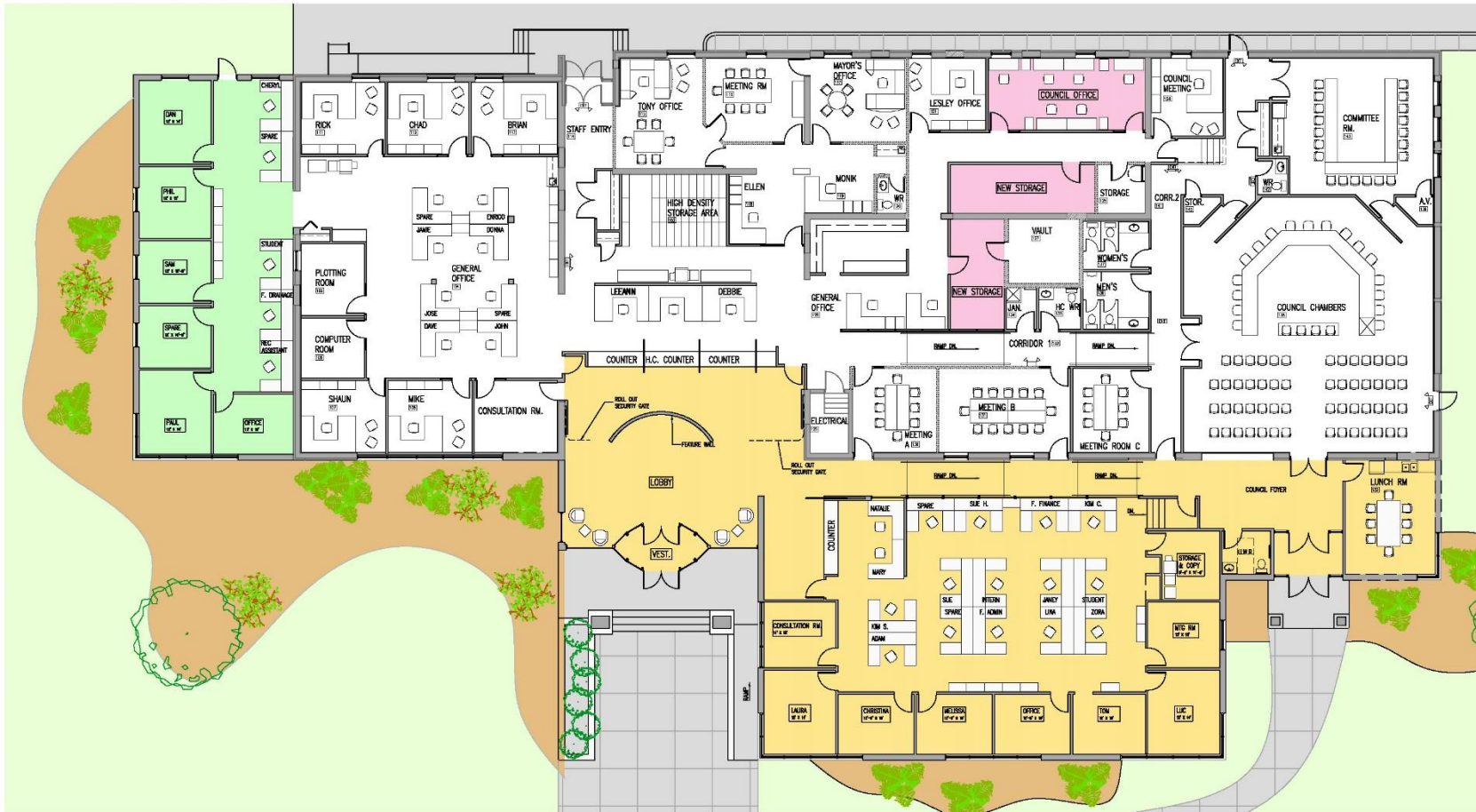
Figure 2 Conceptual Floor Plan